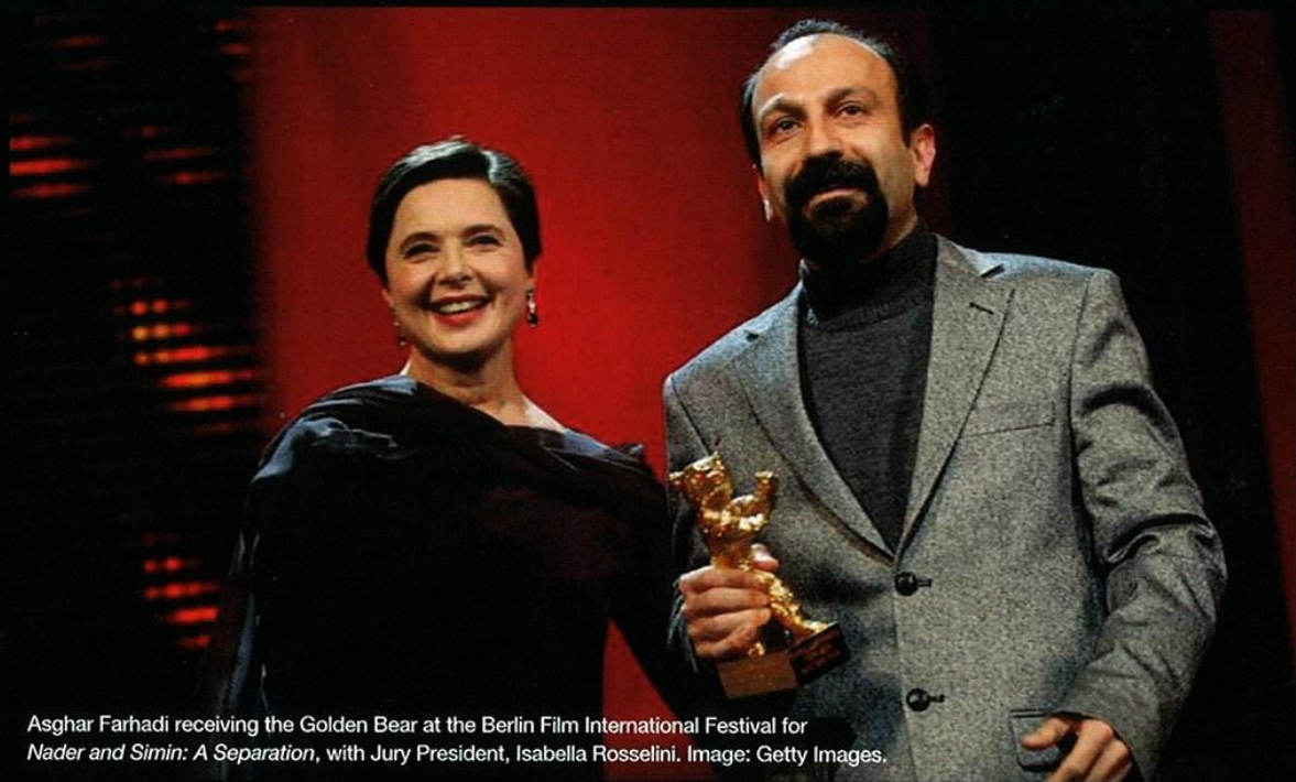
Asghar Farhadi receiving the Golden Bear at the Berlin Film International Festival for Nader and Simin: A Separation, with Jury President, Isabella Rossellini.