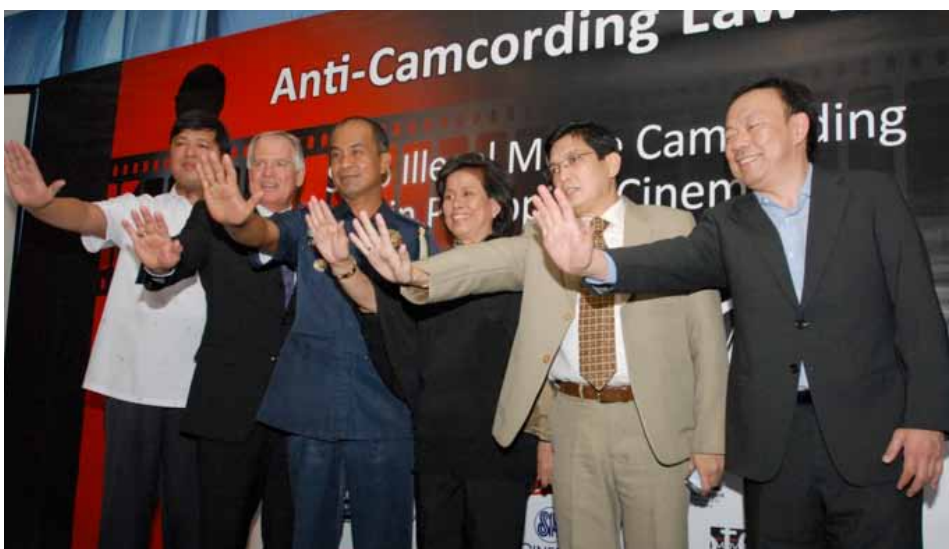
Representatives from the National Cinema Association of the Philippines (NCAP), the Motion Picture Anti Film Piracy Council (MPAFPC) and the Motion Picture Association (MPA) together with The Philippine National Police at the Anti-Camcording Law press conference.

Any person found guilty of violating the provisions of the Anti-Camcording Law shall be subject to a fine of PhP50,000 to PhP750,000 (US$1,000 to US$17,000) and will face imprisonment of a minimum six months and one day to a maximum six years and one day. Individuals who commit the punishable acts for the purpose of sale, rental or other commercial distribution shall suffer the maximum penalty. Foreign offenders face immediate deportation after payment of the fine and serving his/her sentence, and will permanently be refused entry to the Philippines. Offenders who are employees of or hold a seat in government will be disqualified permanently from holding public office, and will forfeit his/her right to vote and participate in public election for five years.