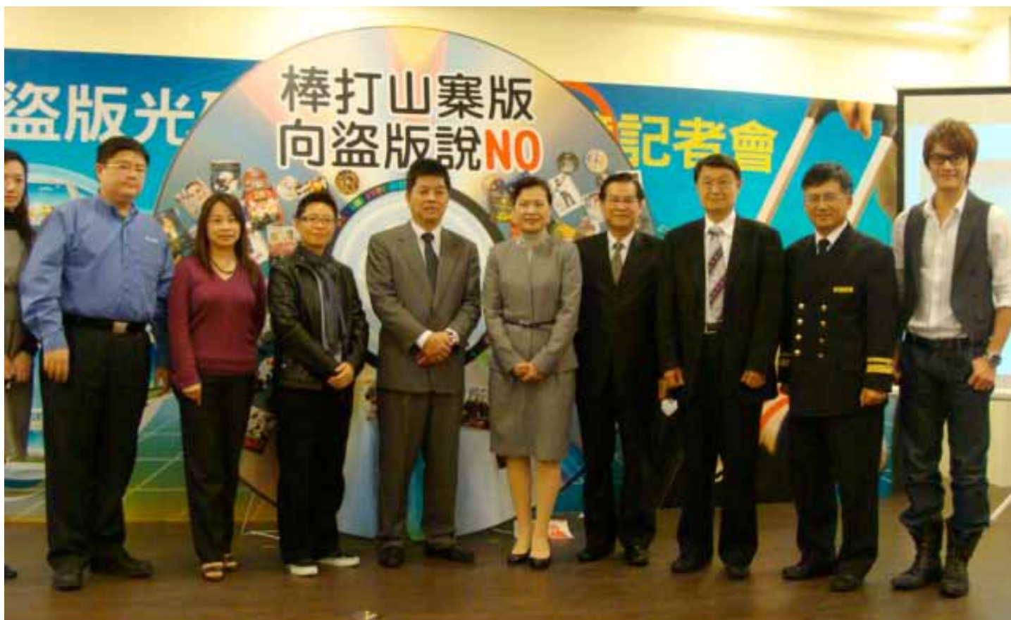
On March 18, the Taiwan Foundation Against Copyright Theft (TFACT) and Taiwan Intellectual Property Office (TIPO) launched the 3rd Taipei-Hong Kong Short Video Competition against IPR Theft, divided into three categories, for high school students, college students, and open participation. Submissions closed on June 30 and the award ceremony will be held in October. The winning videos will be used by both government and private sector organizations to promote IPR protection.