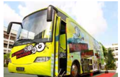
The Originals HIP Adventure Bus making its debut at Yishun Town Secondary School.