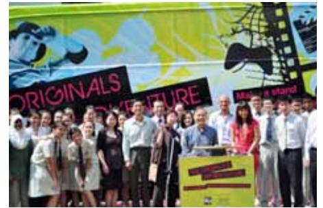
Associate Professor Ho Peng Kee with students of Yishun Town Secondary School at the debut of The Originals HIP Adventure Bus.

Also featured in The Originals HIP Adventure are kiosks on which visitors can engage in simulated game play to learn about the importance of IP protection. Other sections of the bus include sound marks sampling and an IP e-Learning kiosk. At the end of their bus tour, visitors can make a pledge to honor intellectual property. The Originals HIP Adventure will make a four-month-long journey to more than 100 schools and public community spaces island-wide.