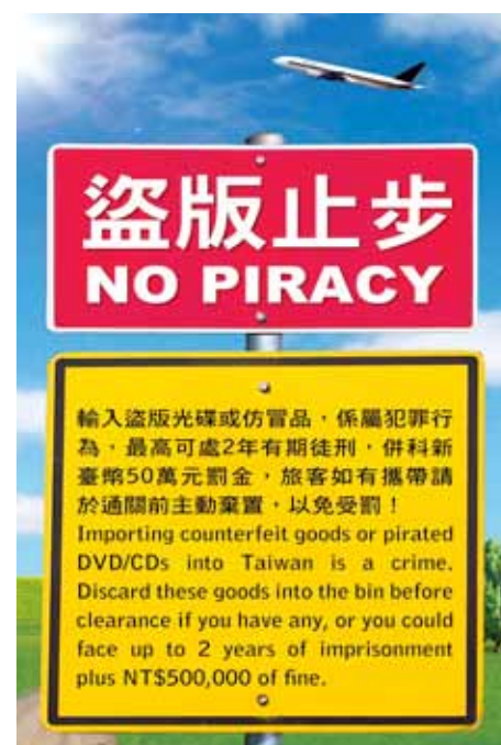
Posters in various locations within the arrival hall at the Song Shan Airport, Taiwan