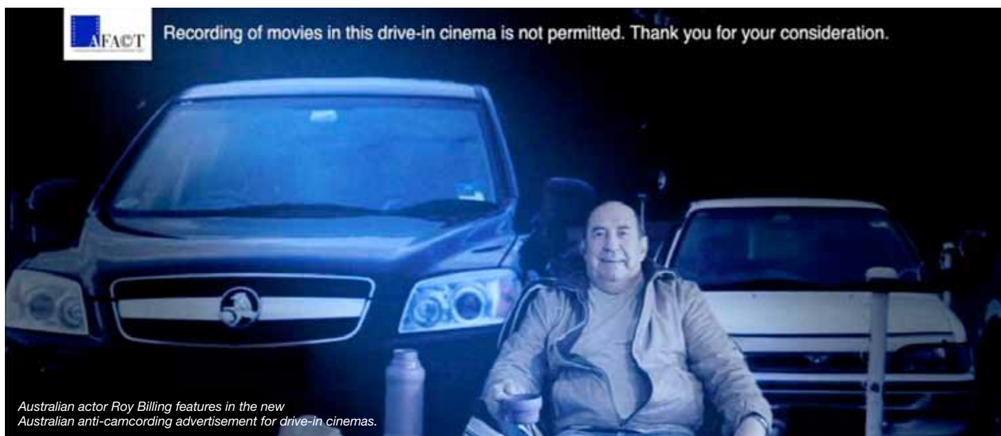
Australian actor Roy Billing features in the new Australian anti-camcording advertisement for drive-in cinemas.

In the first half of this year, AFACT was involved in 34 anti-piracy raids resulting in the seizure of 400 optical disc burners and more than 170,000 illegal movie and television show DVDs. Australian courts recorded six convictions during the period.