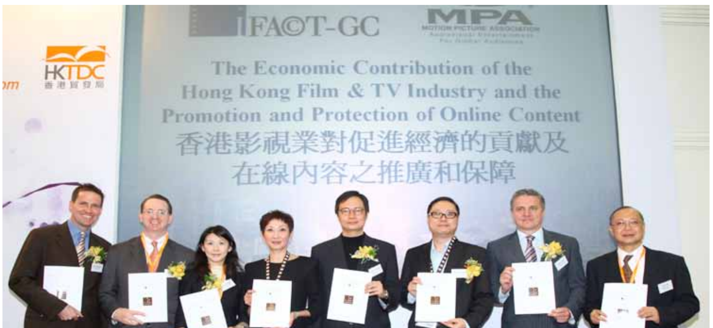
MPA & IFACT-GC representatives at the launch of the Economic Contribution Report

On World Intellectual Property Day (April 26) IFACT-GC released the results of a survey that confirms a strong preference among Hong Kong residents for a graduated response system as an effective means to stop illegal file sharing.