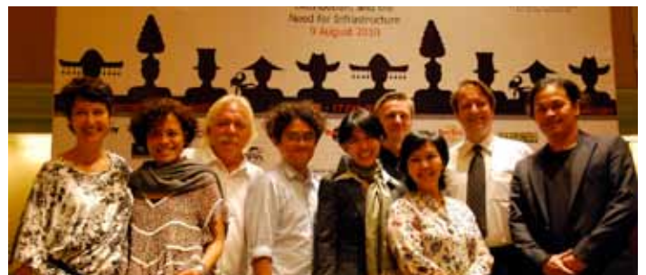
Panellists at the Balinale 2010 Film Industry Forum

attended by 50 up-and-coming as well as established producers and directors. In addition to debating the benefits of and barriers to distribution and exhibition in Indonesia, the panellists discussed the experience of producing Eat, Pray, Love (a portion of which was shot on the Indonesian island of Bali).