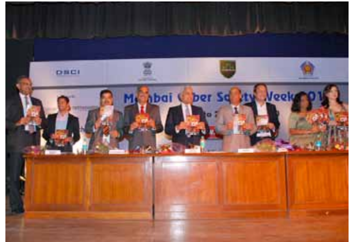
Launch of comic book "Escape from Terror Byte City" at the Mumbai Cyber Safety Week 2010.

A local adaption of a comic originally developed by the New Zealand Federation Against Copyright Theft, the comic book tells the story of two boys who become trapped in a virtual city after downloading an unauthorized copy of a movie from a peer-to-peer filesharing site. The comic will be published in three languages – Hindi, Marathi and English – and has been endorsed by the Department of Information Technology, Mumbai Police, Data Security Council of India (DSCI) and the National Association of Software and Services Companies (NASSCOM).