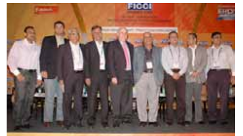
The Members of the Alliance Against Copyright Theft (AACT).