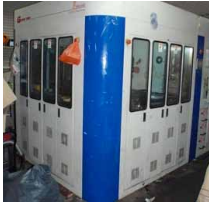
A separate unit within the factory housing the DVD production lines.

MDTCC officers seized two DVD replicating lines, one offset printer and a bonding machine and more than 5,000 copies of pirated DVD movies. It is estimated that the factory had a production capacity of more than 7 million pirated DVDs a year. Among the seizures were movie titles including Case 39 , Ninja Assassin , Alvin and the Chipmunks: The Squeekquel , Spy Next Door , Tooth Fairy and The Ugly Truth .