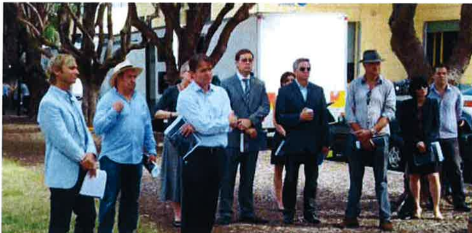
Economic Impact Report launch on the set of A Few Best Men at Fox Studios