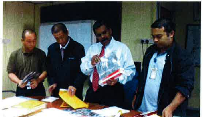
Malaysian Police officers examine items seized during the raid.