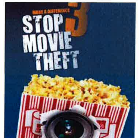
Make-A-Difference 3 DVD and brochure.

More than 400 participants received a copy of the DVD and training package at the convention. More will be distributed to cinemas across the region. This latest version of the 'Make A Difference' training package for cinema staff will serve to keep exhibitors abreast of the latest technology being used by criminal syndicates and assist them in identifying camcorders making these recordings.