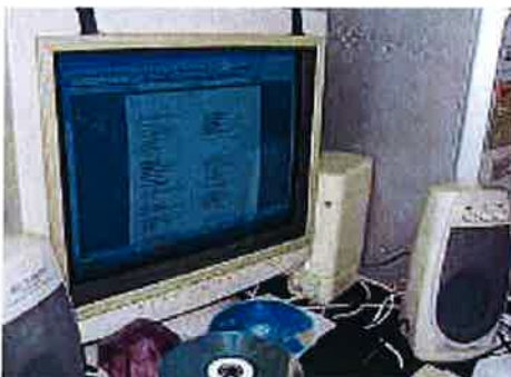
Computer and multimedia equipment which is believed to have been used for uploading illegal movies.

On February 24, 2011, acting on information provided by the Malaysian Federation Against Copyright Theft (MFACT), officers from the Ministry of Domestic Trade and Cooperative Consumerism (MDTCC) arrested a 34-year-old man responsible for brokering the sale of large amounts of camcorder and screener content around the world. The arrest represents the conclusion of a complex cross-border investigation and operation named Operation Hourglass that required the joint efforts of a number of agencies and organizations around the world.