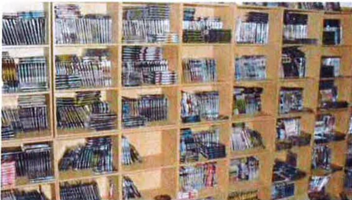
Counterfeit DVDs seized in police raid on a house in Taman Rainbow in December.

The enforcement team found 124,185 illegal DVDs infringing a variety of titles including Salt , Toy Story 3 and Alice in Wonderland . Three suspects were arrested.