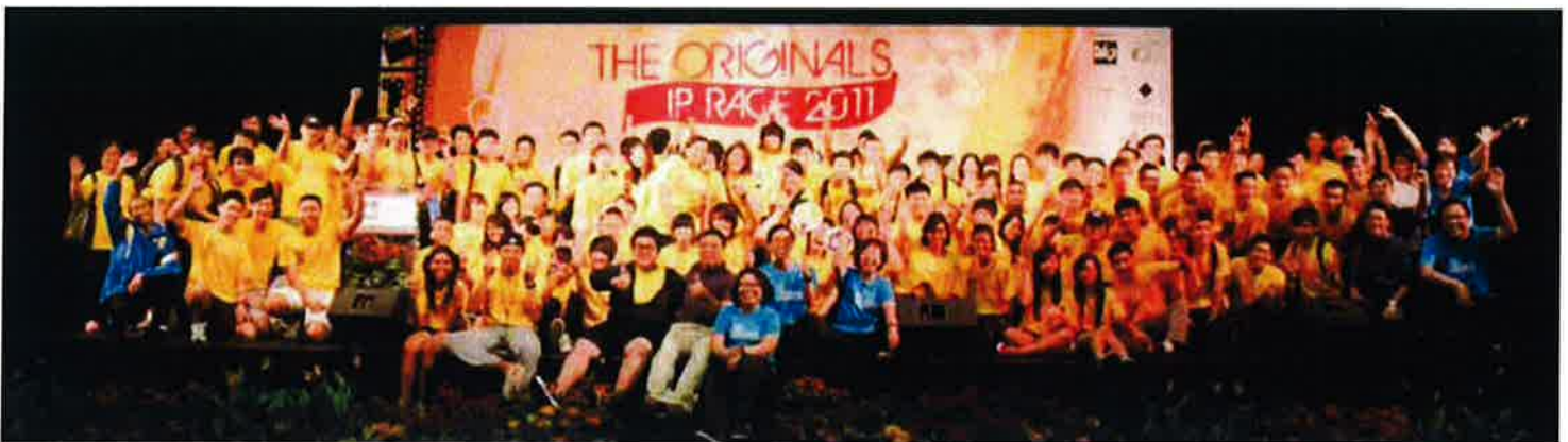
Competitors in The Originals IP Race 2011 at the prize presentation ceremony.

Team The Woohooooos emerged as Champion and bagged prizes worth a total of S$1,500. Coming in second were Team Numero Uno and in third Team T.I.D.C. The MPA is proud to be one of the sponsors of the annual event.